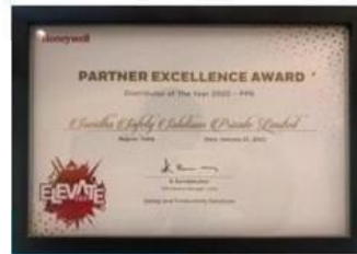
Partner Excellence Award PPE - 2020