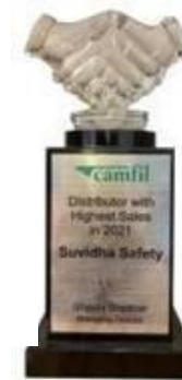
Distributor with Highest Sales for the Year 2021