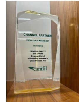
Excellence Award with Highest Sales for the Year 2023