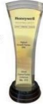
Highest Growth Partner PPE of the Year - 2016