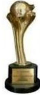
Best Distributor PPE of the Year - 2015